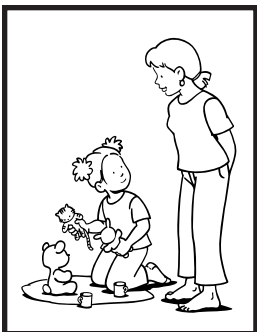
Lesson 9 LG 5