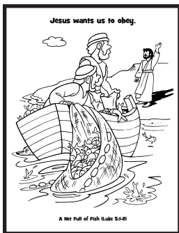
Lesson 9 SG 14

Open them. [ Open hands. ] Close them. [ Close hands. ] Open them. [ Open hands. ] Close them. [ Close hands. ] Give a little clap. [ Clap hands. ] Open them. [ Open hands. ] Close them. [ Close hands. ] Open them. [ Open hands. ] Close them. [ Close hands. ] Fold them in your lap. [ Fold hands in lap. ]