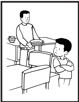
Lesson 9 LG 4