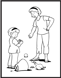
Lesson 9 LG 3