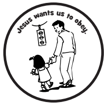
Lesson 9 SG 13