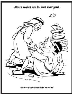
Lesson 12 SG 10