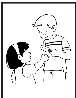
Lesson 12 LG 4