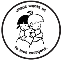
Lesson 12 SG 9