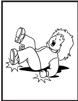
Lesson 12 LG 6

That's right! They're sharing a popsicle. Jesus [point up] wants us [point to self] to love everyone [spread arms wide]! Can you love someone who shares their popsicle with you? One, two, three . . . [ Kids respond, "Yes, I can. Yes, I can!" ]