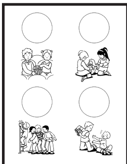
Lesson 12 SG 7

Point to the picture of the children standing in line by the slide. What do you see in this pic-