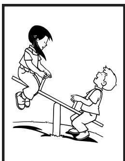
Lesson 12 LG 5

people because Jesus [ point up ] wants us [ point to self ] to love everyone [ spread arms wide ]! Jesus [ point up ] wants us [ point to self ] to love everyone [ spread arms wide ]!