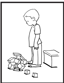
Lesson 14 LG 3