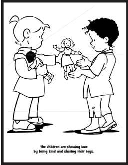
Lesson 14 SG 7