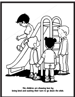
The children are showing love by being kind and waiting their turn to go down the slide.

Let's see what else Grover the Game box has for us today. [ Look in Grover and pull out the puzzles. ] Wow! It's puzzles. I love puzzles! These puzzles are all about how we can be kind to others. Joseph's brothers were unkind to him. But was Joseph kind to his brothers, anyway? [ Yes. ] Today we learned that God wants us to love others by being kind. God [point up] wants us to be kind [point to smile and tilt head]. We are going to put together three puzzles that show how we can be kind to others. Let's all be kind to each other and take turns putting the pieces together.