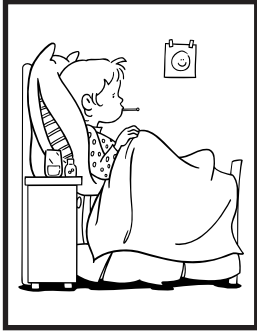
Lesson 14 LG 4