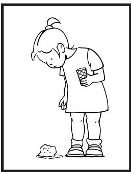
Lesson 14 LG 2

Good job, friends! Touch your nose. [ Touch nose. ] Now, touch your ears. [ Touch ears. ] And sit down. [ Motion for kids to sit down. ] Friends, what does God want us to do? God [point up] wants us to be kind [point to smile and tilt head]. Hey, Grover, we're ready to play a game! [ To kids. ] Grover always has fun things inside for us! I'll look and tell you what's inside. [ Open Grover. ]