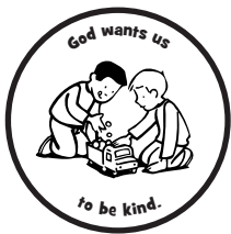
Lesson 14 SG 8