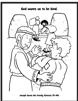
Lesson 14 SG 9

[Do one puzzle at a time. Gather the children in a circle and give each of the four pieces to a different child. Ask the kids to put their piece in place with the other three pieces in the middle of the circle.]