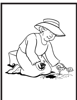
Lesson 15 SG 6

your dad clean the house? [ Allow kids to respond. ] Let's pretend to help clean the house by washing the windows. Hold up your rag to wash the windows. [ Pretend to hold up a rag in one hand and move it in a circle to clean the window ] Wash, wash, wash, wash, wash, wash. Good job! What did we learn today? God [point up] wants us to help [clap] others [clap]. I'm having such a good time! Let's stand up and sing!