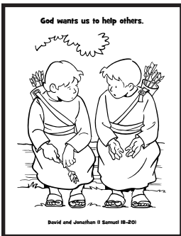
Lesson 15 SG 9

Today we learned that God wants us to show love to others by helping. God [point up] wants us to help [clap] others [clap]. Let's pray to God and tell Him "thank You" for today's Bible story. [Lead the children in the following finger play.]