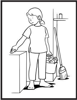
Lesson 15 SG 3