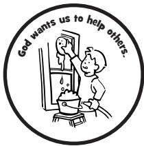
Lesson 15 SG 8