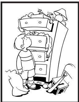
Lesson 15 SG 4